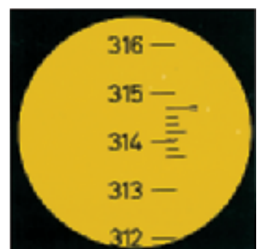
NAK2 circle reading (360°) 314°42'