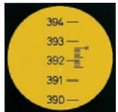
NAK2 circle reading (400 gon) 392.66 gon