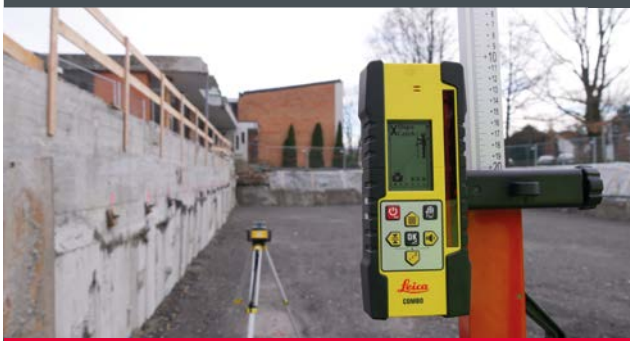
HORIZONTAL & SLOPE LASER