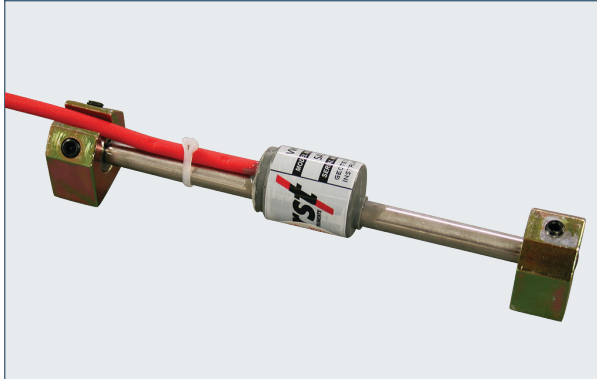
Vibrating Wire Arc Weldable Strain Gauge