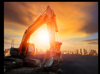
Excavation & Mining