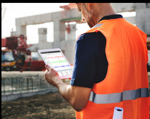
Construction Site Monitoring