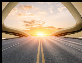
Civil Engineering Projects