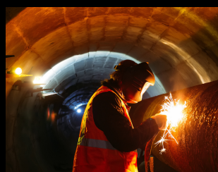
Tunnel & Subway Monitoring